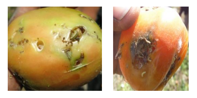
Figure 3: Typical tomato fruit damage (left) caused by Tomato leaf miner and subsequent rotting (right) resulting from secondary infection.

The impact of the emerging and re-emerging high impact transboundary pests was summarised as;