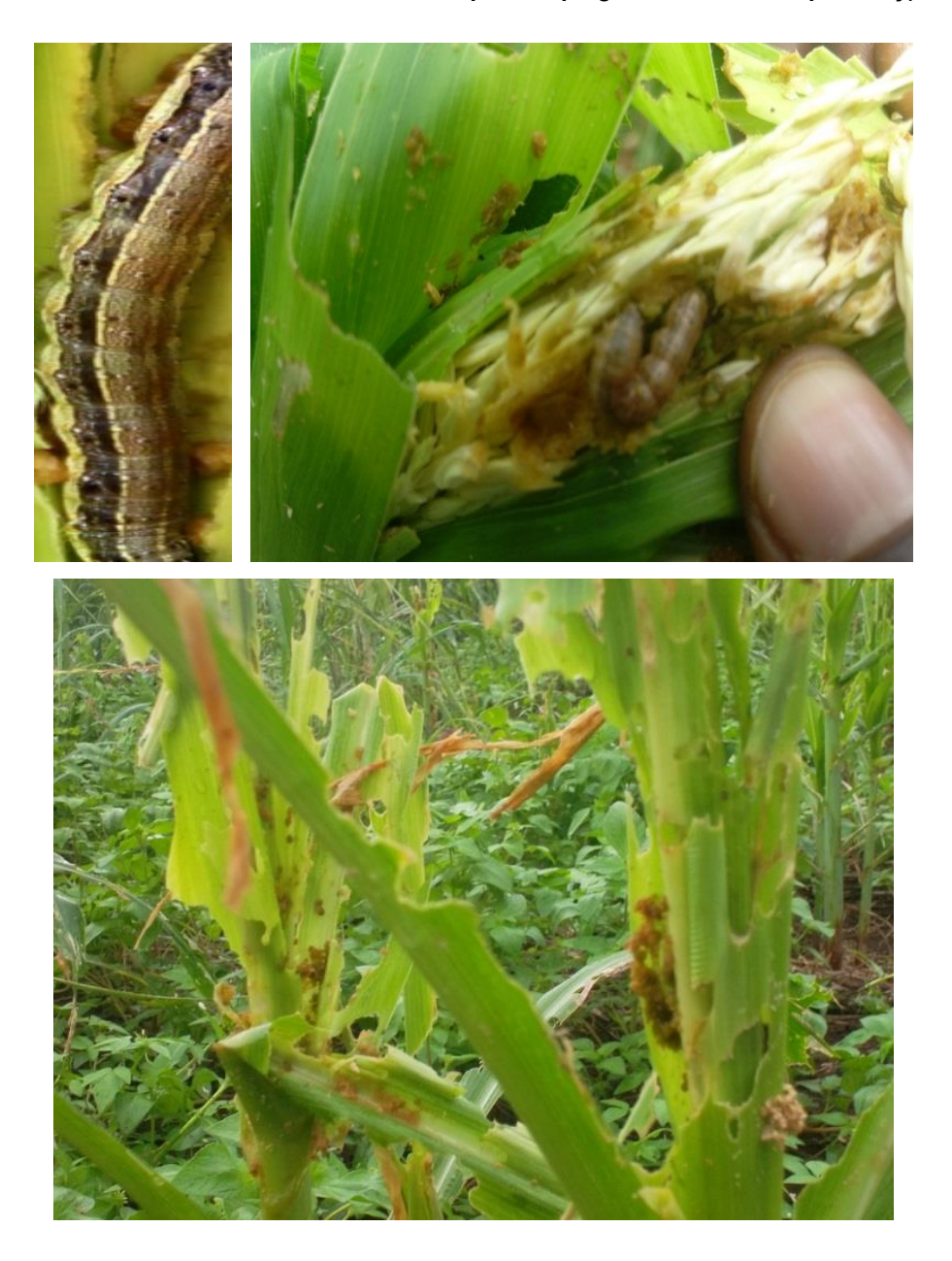
Figure 2: Damage caused by Fall Armyworm on Maize. Note: Fall Armyworm on leaf, damage on inflorescence and leaves featured on top left, top right and bottom respectively)